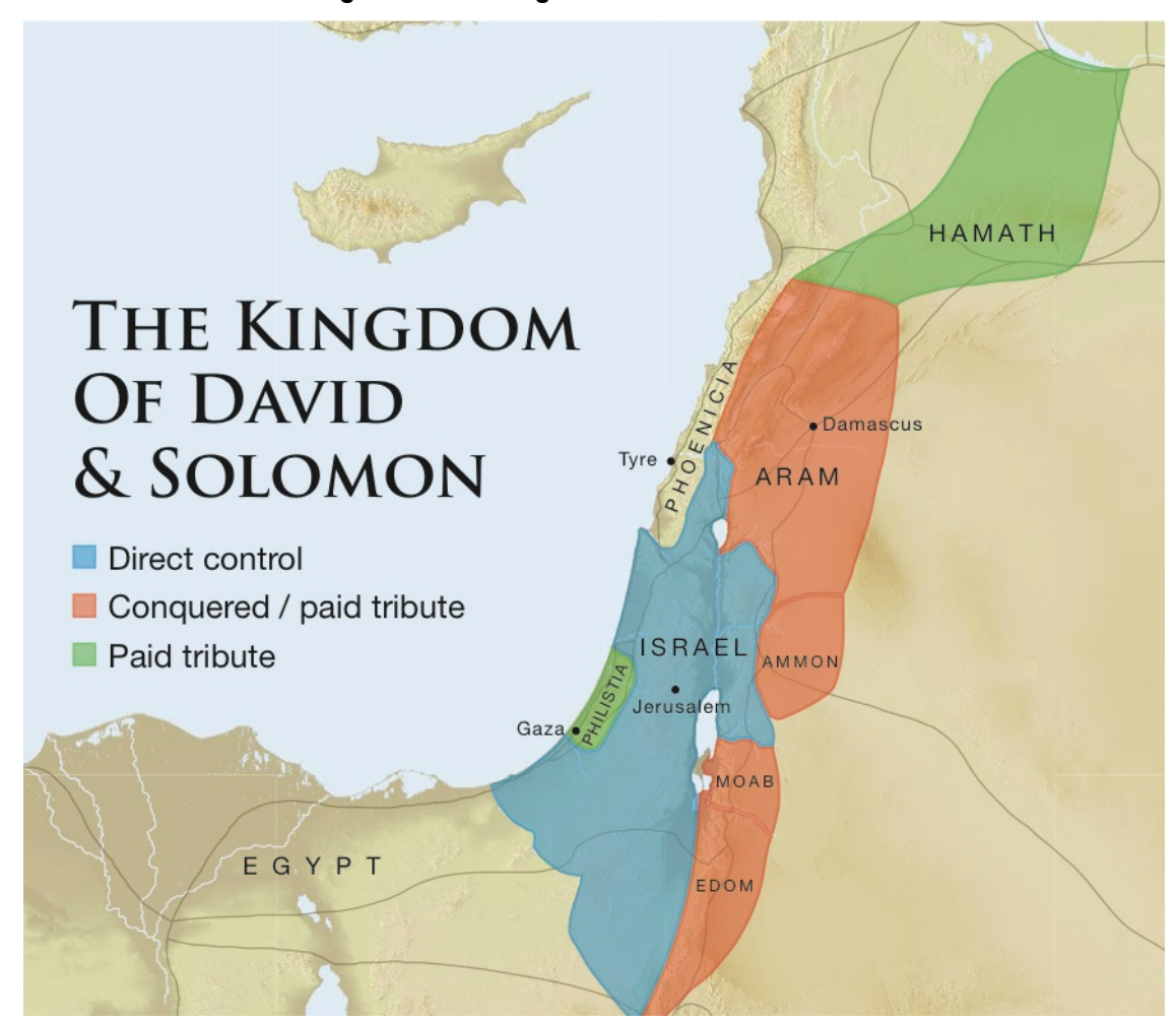
Fig. 12.1. The Kingdom of David & Solomon