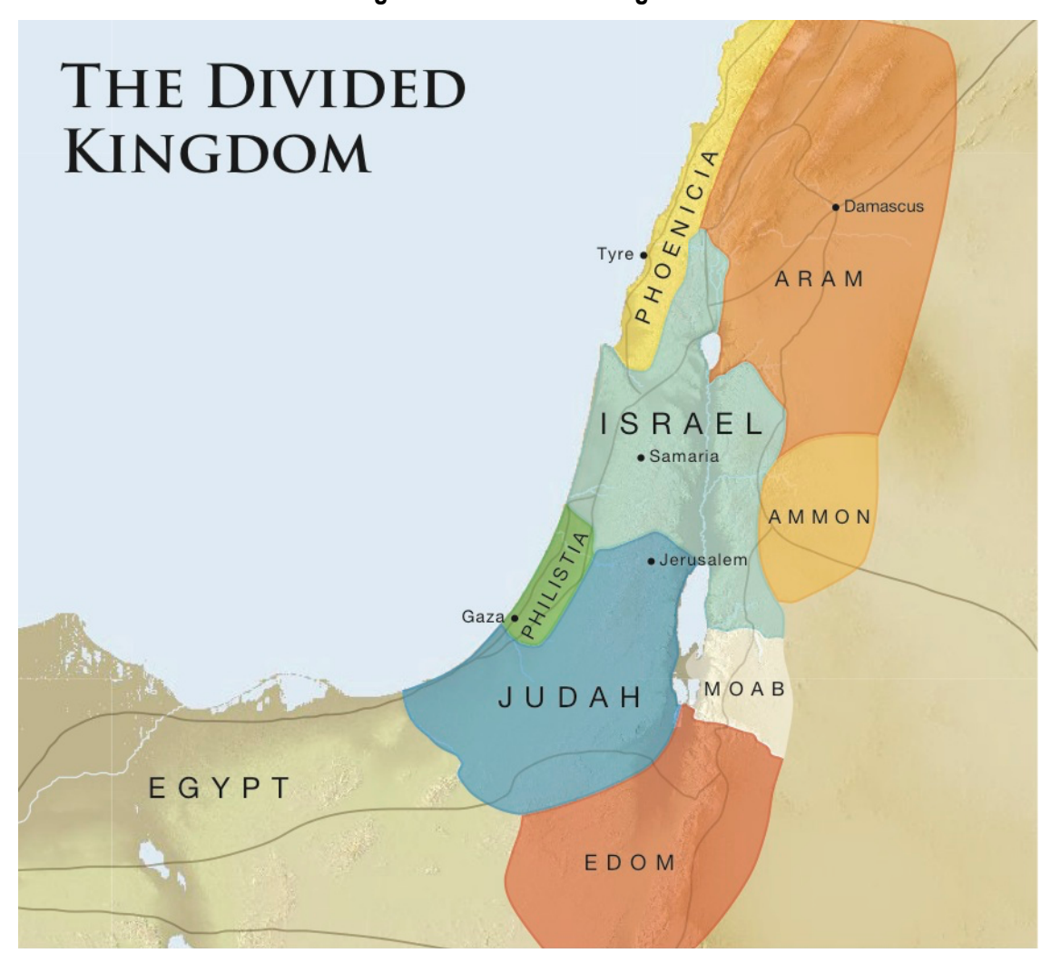
Fig.12.3. The Divided Kingdom