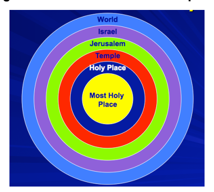
Fig. 5.3. Gradations of Sacred Space