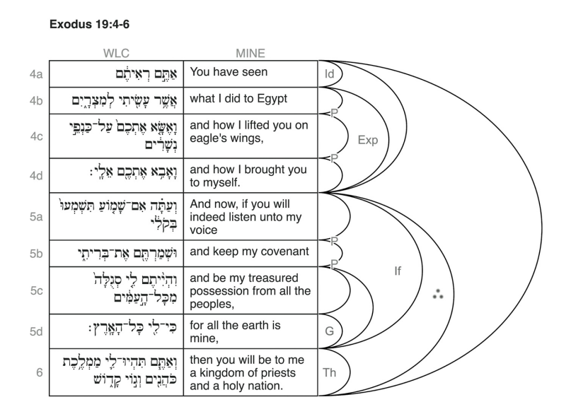
Fig. 11. Arc of Exodus 19:4-6

Note that 19:4 recalls YHWH's great deliverance of Israel from Egypt. And then, with the inference-marker ועַתָּה ("and now") in 19:5a, 19:5–6 draw a conclusion from the great salvation related to Israel's sacred task. The inference section itself has two units: the conditional protasis in 19:5 ("if") and the apodosis in 19:6 ("then"). Because God saved Israel, if they will heed his voice, keep his covenant, and be his treasured possession from all the earth, then they will serve for him as a royal priesthood and holy nation. We can now display these various relationships through an arc (fig. 11).