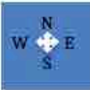
Fig. 6.2. Israel's Camp Arrangement (Numbers 1-4, 10, 26)